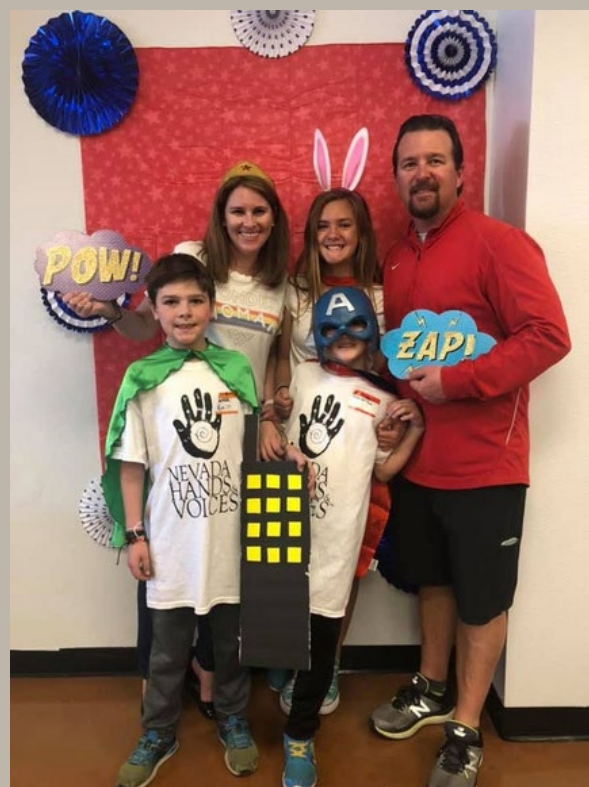
HANDS AND VOICES

THESE SPACES PROVIDE CONNECTION, INFORMATION, AND ENCOURAGEMENT.